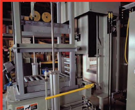
Door open. Bridge up.