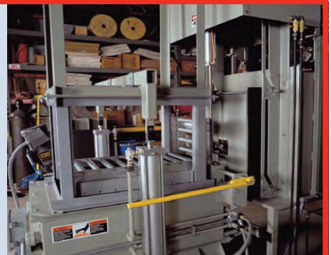
Door closed. Bridge up.

Your Thermal Investment Deserves Special Treatment