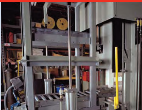
Door open. Bridge down.