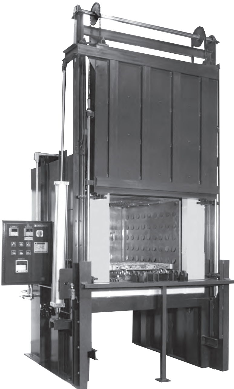
Model DRG 3648 with pneumatic vertical door, roller hearth tray system and gas fired operation.

The DV/DR Series floor standing recirculating cabinet ovens feature high volume air recirculation for high temperature uniformity, gas or electric operation, a stainless steel interior and a precision PID digital control system. They are designed for heavy duty production heat treating applications such as tempering, annealing and solution heat treating, although they have many other uses. The furnaces are rated to 1,300°F (700°C) operation. Horizontal (DV) or vertical (DR) doors are available.