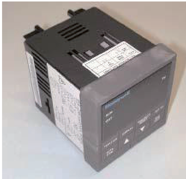
TOP: LEFT THERMOCOUPLE, MIDDLE LEFT: THERMOCOUPLE SELECTOR SWITCH, BOTTOM LEFT: ELEMENT HOLDER, ABOVE: HONEYWELL SINGLE PEN RECORDER

Mention this flyer to receive discount on all parts orders placed by 12/15/21