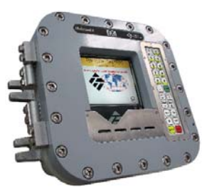
EXL Enclosure (Division 1)