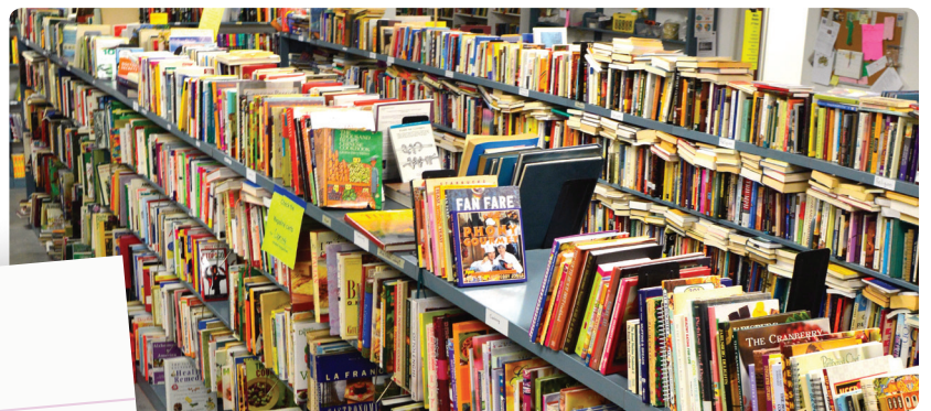
The basement is filling up and we will be ready on April 27th for Opening Day!

We invite you to join us, whether you're looking for a new book or just want to say thank you to our volunteers. The proceeds from the sale go directly to the library. Whether you live in Media, Swarthmore - or even Toronto - this is not a book sale you can miss.