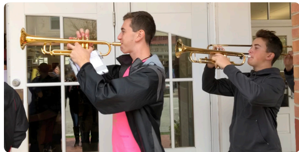
Strike up the Band. Penncrest High School Marching Band opened our last Book Sale and paraded all through the library before giving us a great concert on the porch.

We invite you to join us, whether you're looking for a new book or just want to say thank you to our volunteers. The proceeds from the sale go directly to the library. Whether you live in Media, Swarthmore - or even Toronto - this is not a book sale you can miss.