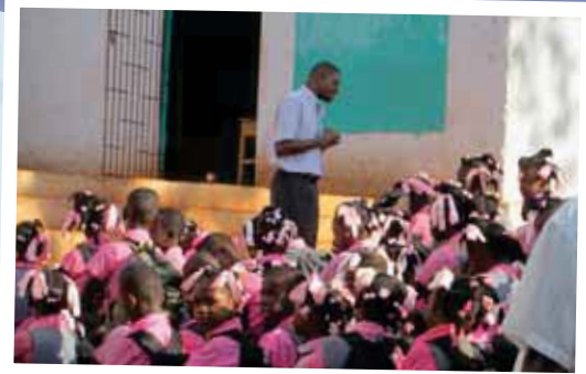
▲ The Sisters of St. Francis continue to partner with the Sylvania Franciscan Sisters to help rebuild Haiti. Our Haitian brothers and sisters are grateful for your support.