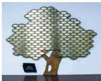
▲ This tree is a plaque for residents to remember their friends and neighbors who have passed away while living at the center.