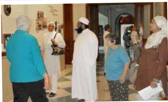
Members of the Zubaida Foundation, an Islamic organization which supports interfaith dialogue, peruse the congregational history display in the halls of Our Lady of Angels Convent. Since 2011 our sisters and members of the Muslim group meet twice a year, alternating the location of the gatherings between the mosque and the motherhouse.