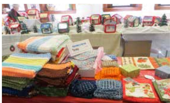
A sampling of some of the handcrafted items from our 2017 Christmas Craft Fair.