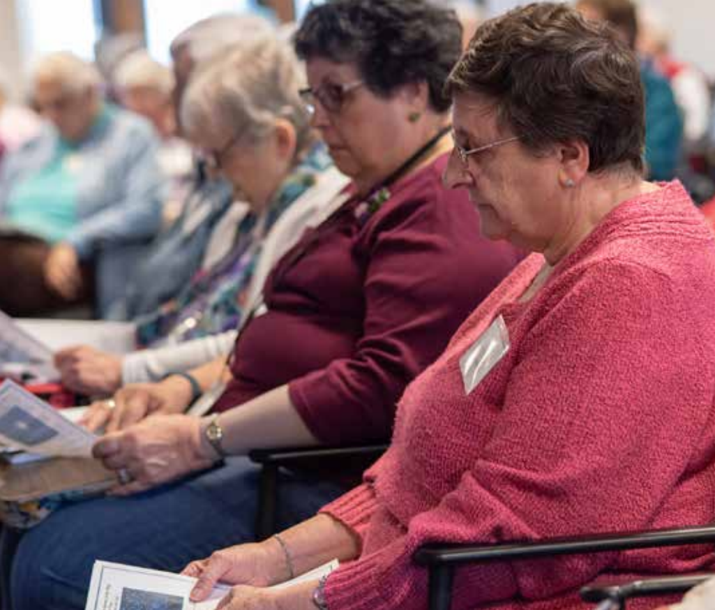
Moments for silent prayer are built into the sessions so that attendees are able to look inward and discover what God is calling them to take from the experience.

Francis, his order already established, had a vision. In this experience, Christ asked Francis what he would want if he could have anything in the world, promising that his request would be granted. Francis answered that he would want for all who came to this church to know their sins were forgiven—a radical request at that time in history when punishment for sins was widely accepted as unavoidable. Jesus granted this request now known as “The Pardon.” Although Francis’ experience is celebrated each year on August 2, thousands of pilgrims journey to this church throughout the year to pray for forgiveness and healing.