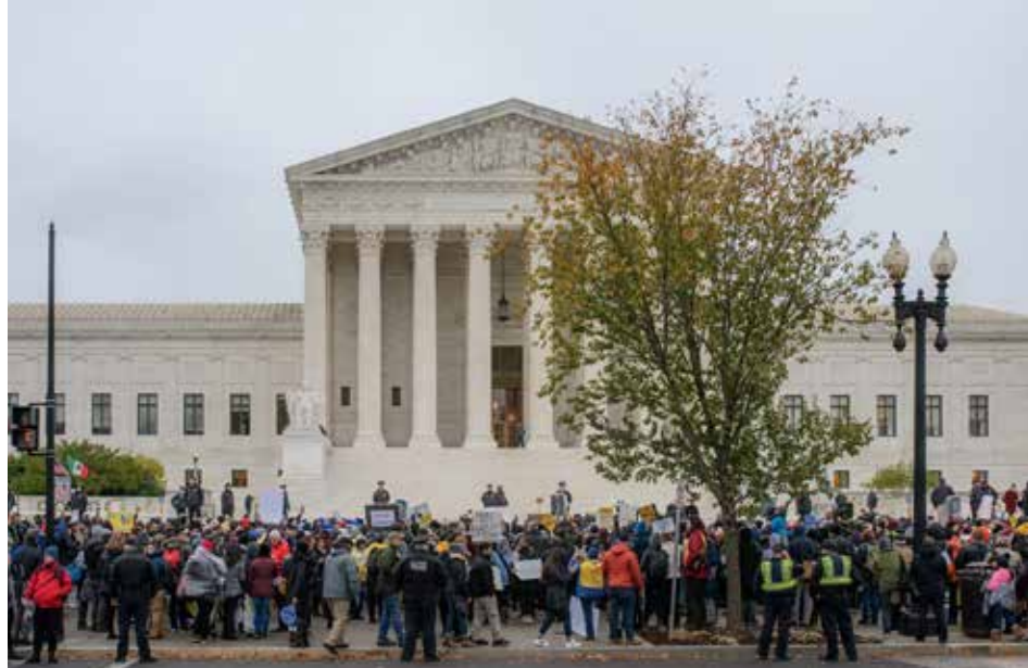
Various groups of protesters combine forces to march on Washington. While many come from different religious denominations, they all share a common goal for justice. The blending of their voices makes them stronger.