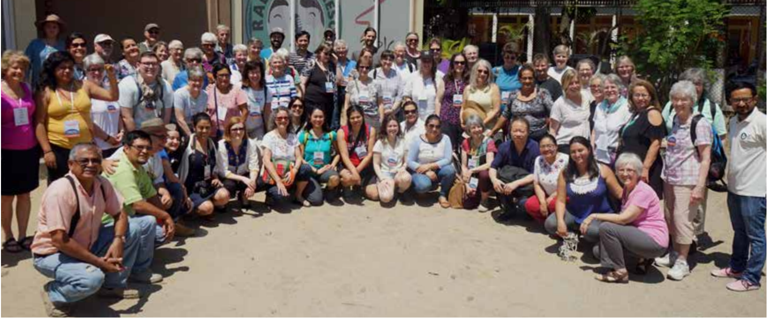
▲ During the Root Causes Delegation, an international delegation of 75 faith leaders involved with issues of social justice and immigration, traveled to Honduras led by the SHARE Foundation, Interfaith Movement for Human Integrity, Leadership Conference of Women Religious, and Sisters of Mercy of the Americas' Justice Team.

feed themselves, let alone to make money through farming. This is due primarily to the drought and land exploitation. The river that provides many citizens with their sole source of drinking water is now in danger of becoming contaminated owing to mine run-off. Citizens continue to fight the government against giving permission to the mining companies to mine so close to the river. “With no clean water, people