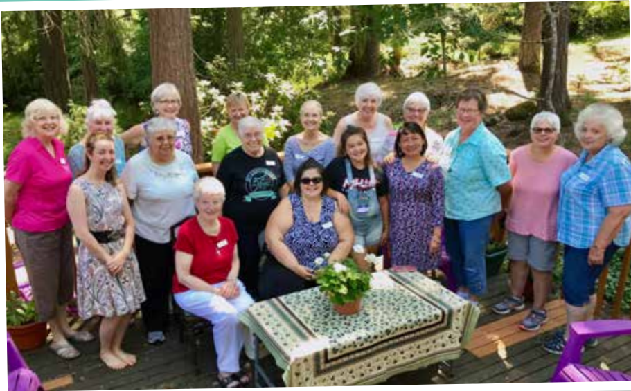
The Portland companions enjoyed a potluck dinner, the beautiful surroundings, and their time together.

W ho are the ‘Sisters of St. Francis of Philadelphia’? Through this section we hope to share a glimpse of our congregation and the individuals who make real its mission.