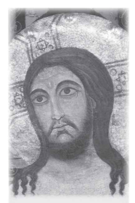
The Incarnation, the fact of Jesus, not the fact of sin, is at the heart of reality

These few indications serve here only to indicate that the Franciscan tradition has a distinctive approach to questions, one that is not well known or commonly viewed as typical of religious discourse in our day.