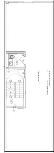
4 th Floor Office/Showroom