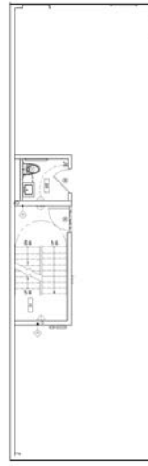
3 rd Floor Office/Showroom