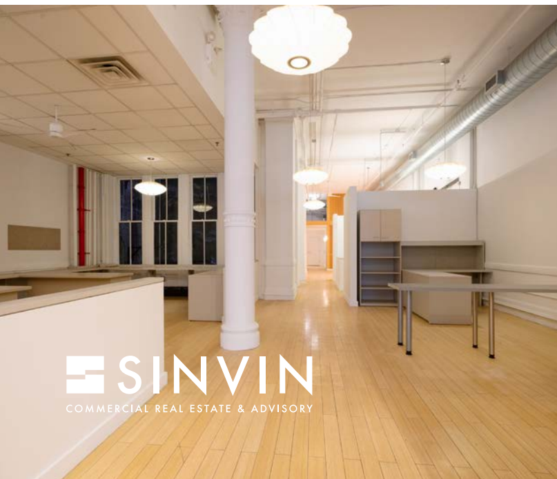
View from 2nd Floor